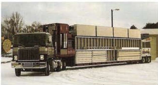
60,000 lbs. trailer weight (8' 6" W/ 13' 4" H/ 48' L)

TM 2700, Majestic's answer to a difficult problem.