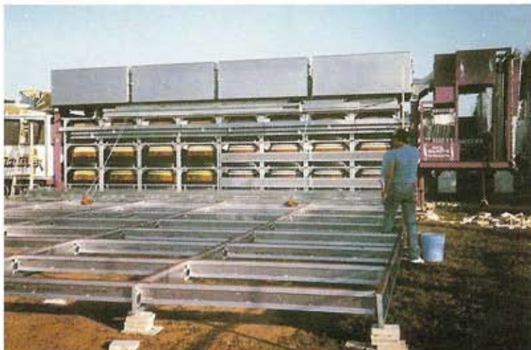
Set-up time: 5 men, 5 hours

Majestic Manufacturing, Inc., 4536 Rt. 7, New Waterford, Ohio 44445 Phone 330/457-2447 — 457-7280 — FAX 330/457-7490