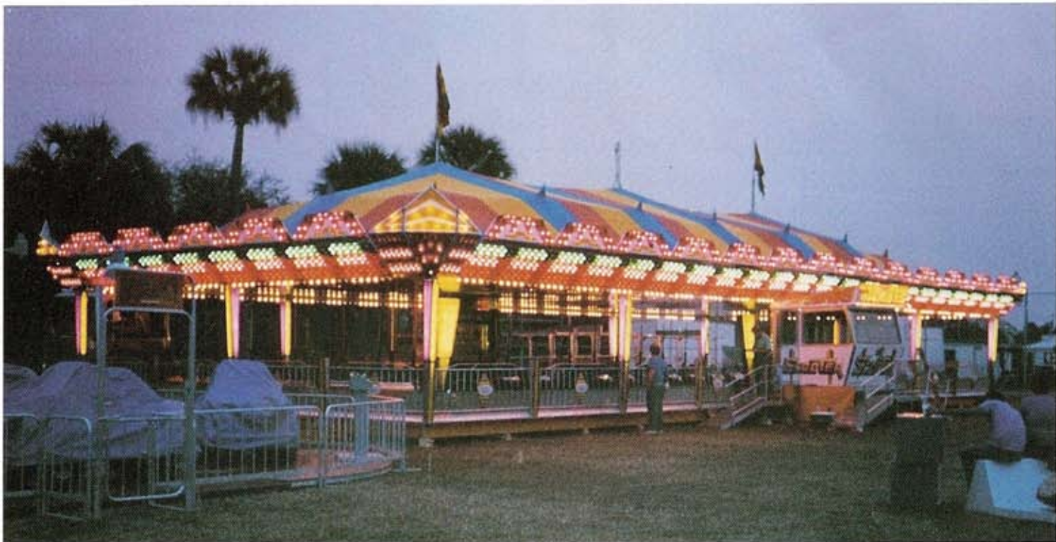
World's First 90' Aluminum Scooter Building with 24 cars all racked on one trailer